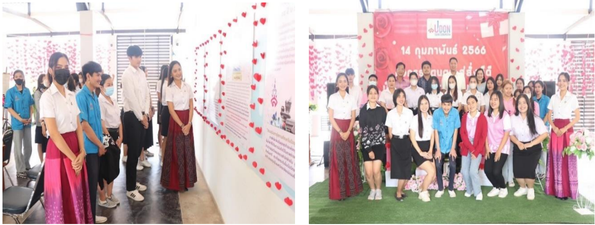
Figure 2: The activity "Promoting Art and Music Culture for Good, Suan Sunandha Memorial Exhibition Learning Academy Fiscal Year 2023".

Figure 2 showed that students were encouraged and developed professional singing skills. And they were also encouraged to wear Thai clothes to preserve the art and Thai culture.