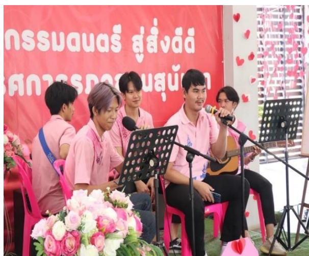
Table 2 illustrated that the opinions on the objectives of the activities were that the students were encouraged and developed professional singing skills, with an average score of 4.80, the highest approval rate. In addition, students were encouraged to wear Thai clothes to preserve the art and Thai culture.